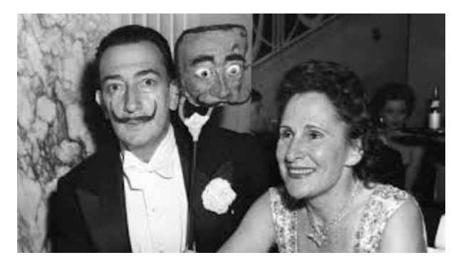
Dalí and Gala, 1952