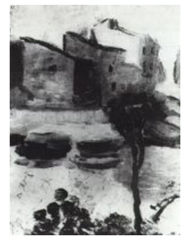
Llane Beach, Cadaques 1918