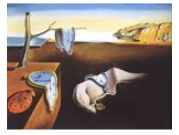
The Persistence of Memory, 1931